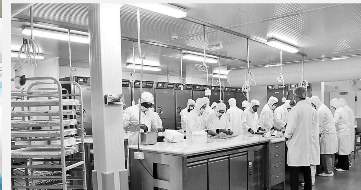
State of the art production facility. HACCP & ISO 22000:2005 certified